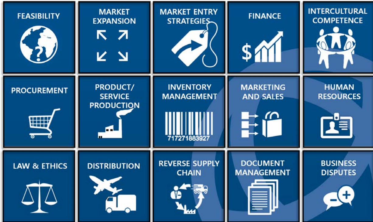
The 15 Major Competency Categories

Each of the 15 major competency categories noted above contain explicit and detailed information that define the expected standard of a fully proficient international trade practitioner. The competencies apply to different occupations or areas of responsibility, including frontline/production or administrative roles, supervisory or midlevel managers, and directors or executive positions.